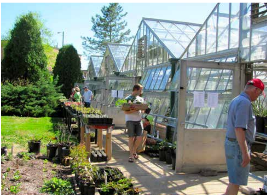
Picking the Perfect Plant