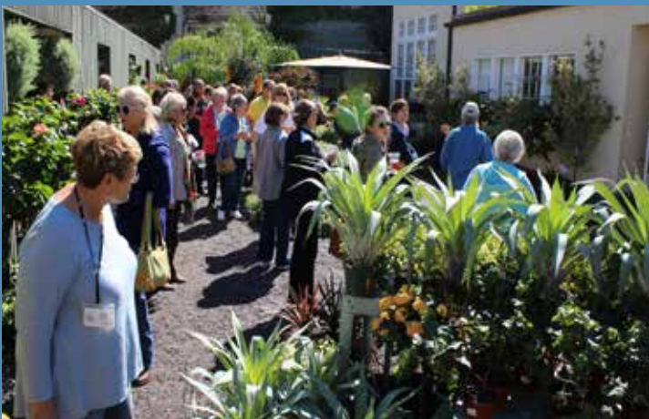
Happy Shoppers at Bowood Farms