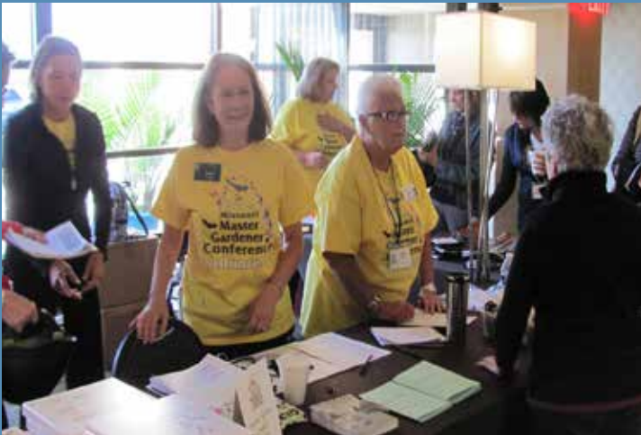
Welcome to St. Louis!