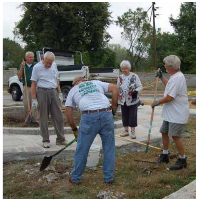
Work on the Jefferson Barracks Gateway

Bring Conservation Home (St. Louis Audubon Society) Builder's Home and Garden Show (St. Louis Convention Center) Ferguson Farmer's Market "Ask the Gardener Table" Florissant Valley Community College Greenhouse Historic Oakland House; Independence Center Jefferson Barracks Cemetery North Gate (St. Louis, MO) Jr. Treekeepers Program Kirkwood City Parks Laumeier Sculpture Park Annual Art Fair (Sunset Hills, MO) Longview Farm Park (Town and Country, MO) Maplewood/Richmond Heights School District MBG Little Shop Around the Corner Mount Calvary Church Rain Garden (Brentwood, MO) Mudd's Grove (Kirkwood, MO) Olivette in Bloom Paraquad (St. Louis, MO) St. Louis University Urban Project St. Louis University Greenhouse Thurman Gateway Park Prairie (St. Louis, MO) Tillie's Corner (St. Louis, MO)