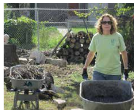
Tillie's Corner remade