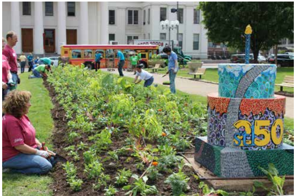
Working on Downtown Medians