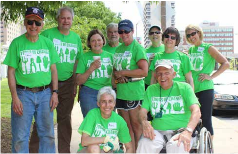
MGs Going Green