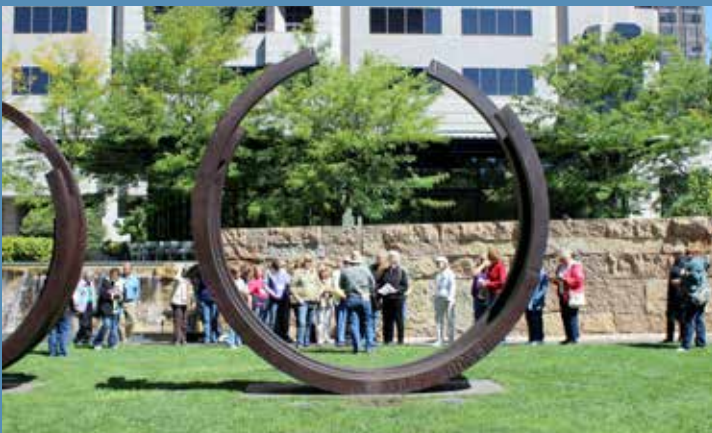
CityGarden: Where Landscape and Art Intersect Downtown