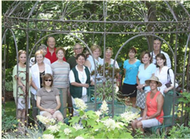
June 2013 Garden Tour Organizers, Hosts and Garden Minders