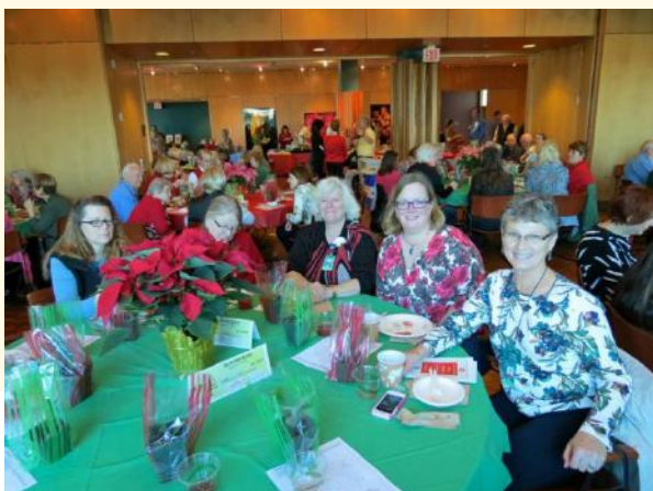
Dec. 2013 Holiday Party

Would you like to know the names of these St. Louis Master Gardeners? The Gnome will reveal all in 2014!