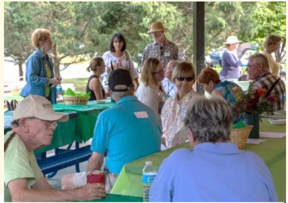
Sept. 2013 Picnic