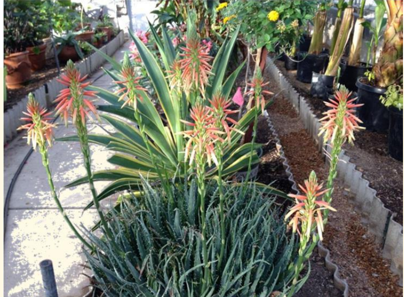
Aloe blooming in the South Tech greenhouse