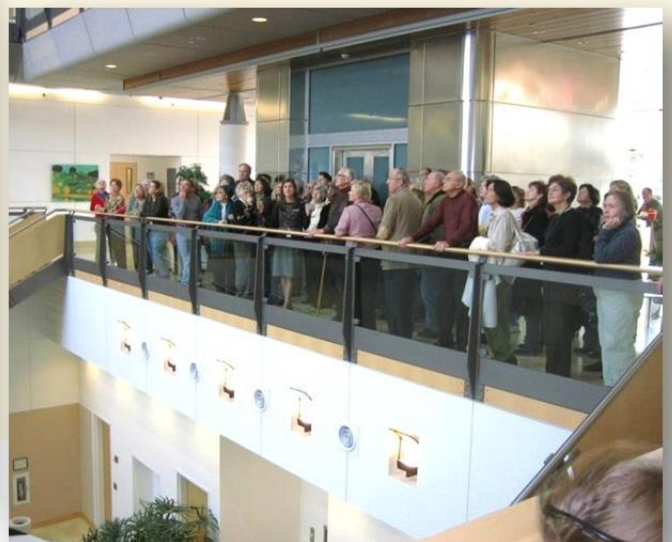
Danforth Plant Science Center Creve Coeur, MO. Jan. 2009