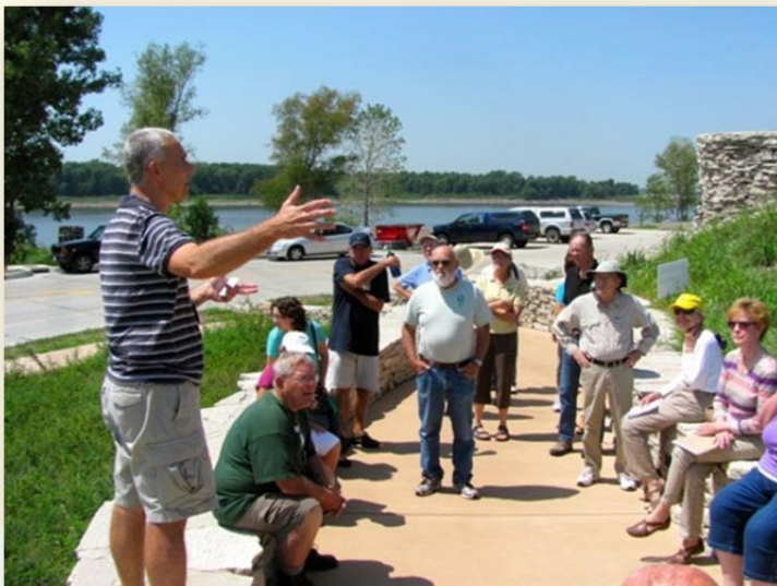
National Great Rivers Research and Education Center Alton, IL, Sept. 2012