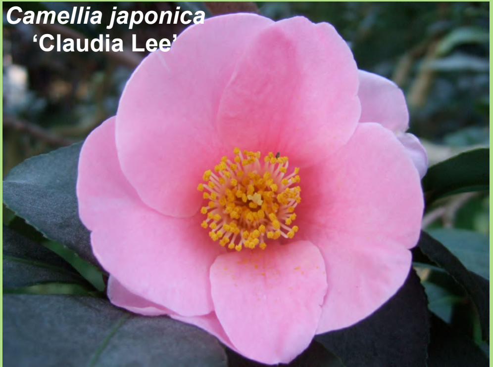
Camellia japonica 'Claudia Lee'