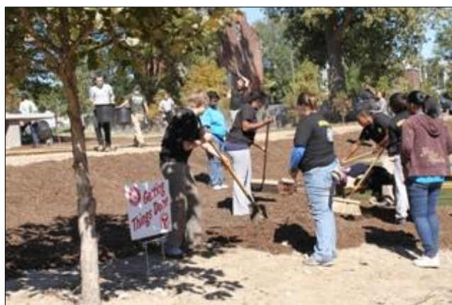
The planting of Forest ReLeaf's 100,000 th donated tree

Missouri Department of Conservation, this milestone planting was part of a larger project that included a total of thirty assorted trees, all of which were propagated at CommuniTree Gardens . The 100,000 th tree, a bald cypress ( Taxodium distichum ), was awarded to the Grace Hill