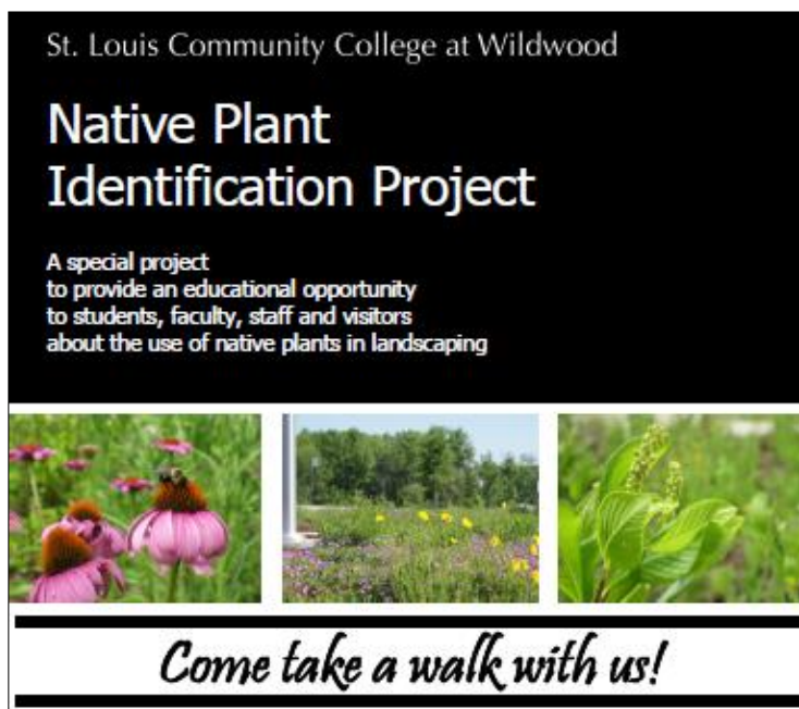
Brochure created by STLCC about the ID project