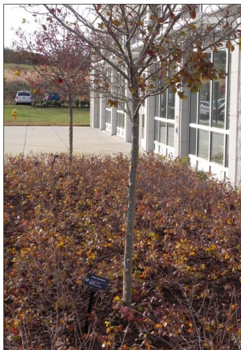
MBG plant tag near a native tree on campus