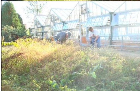
Master Gardeners cleaning up weeds and overgrown ornamentals outside the greenhouses in mid-October.

An agreement emerged which included that in return for utilizing the greenhouses, the Master Gardeners would provide the school with horticultural services and education. These include, among other things, cleaning up and maintaining the areas around the greenhouses, maintaining and caring for plantings around the school, and offering educational courses through the MG Speakers Bureau on a variety of Horticultural subjects for the school and adult education.