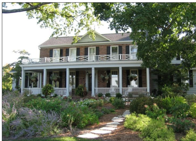
Longview in the fall

In creating memorable gardens on the park property, the resulting display became the backdrop for numerous weddings and other celebrations. A sense of satisfaction is derived from observing families having their portraits taken in the gardens. The Master Gardeners' education has been put to good use on a daily basis in identifying and eradicating pests, selecting the best plants for a specific location, and answering the many questions from home gardeners. This is an example of Master Gardeners doing what they were meant to do...teach by doing, beautifying where they live and engaging the public through gardening.