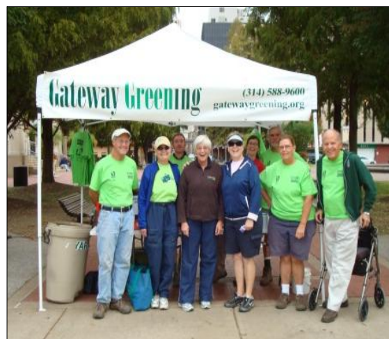
Master Gardener crew working with Gateway Greening at Kiener Plaza in Downtown St. Louis