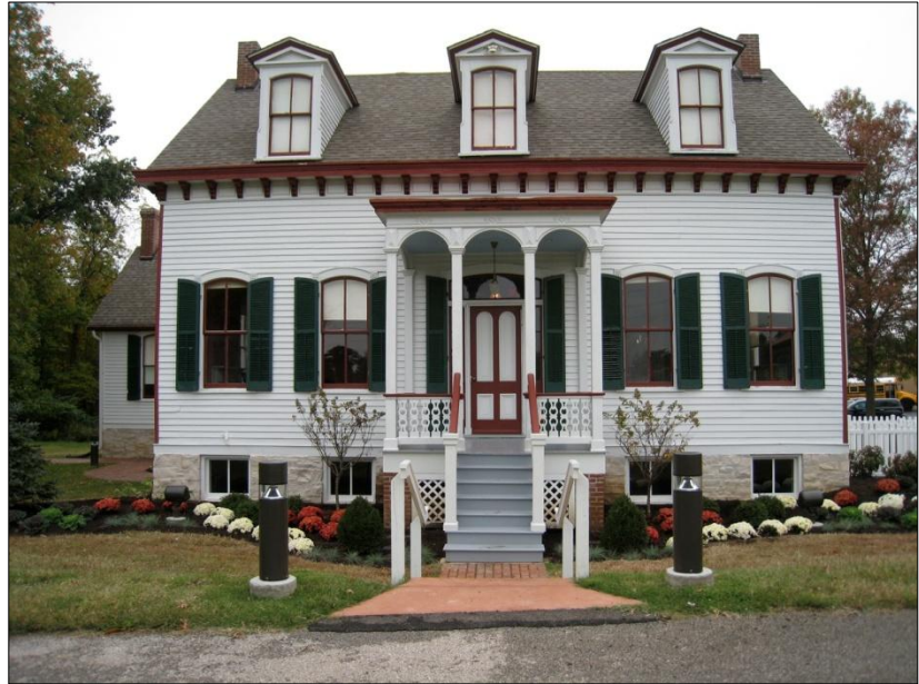
The Tappmeyer House with flower beds in bloom

Master Gardener Claire Chosid gathered a group of MG's and other local volunteers to begin the work of designing and installing demonstration gardens at the Tappmeyer house in 2009 which continued in 2010. The project began as a war against the invasive Honeysuckle in Millennium Park, a challenging and rewarding initial step of the project. A vegetable garden was later established using recycled planks from the "Pots to Planks" program at Missouri Botanical Garden.