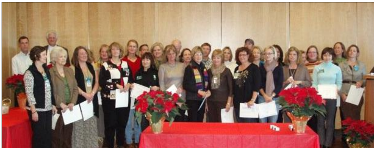
The St. Louis MasterGardener 2010 class at the holiday party.