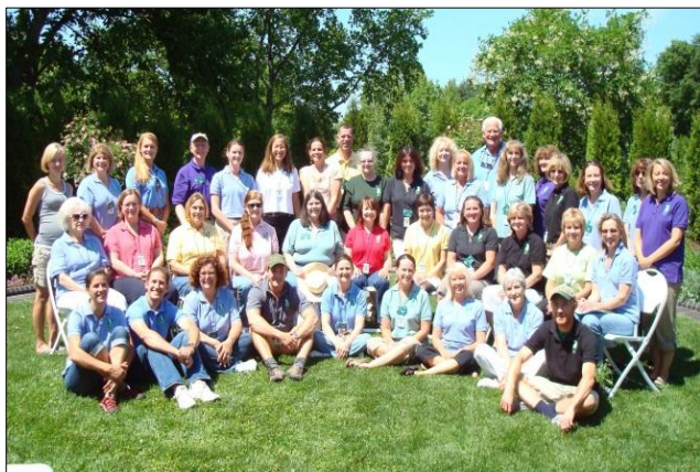
Students who completed the MG course in 2010

The Master Gardeners are proud to announce the certification of 36 new Master Gardeners in 2010. The members of the 2010 class attended 16 training classes at the Botanical Garden's Kemper Center Classroom each Thursday afternoon from January through May. The classes were taught by members of the Garden Staff and University of Missouri as well as other highly regarded members of the local horticulture community. The classes included instruction in basic botany, soil preparation, vegetable gardening, pruning and an overview of perennial and annual flowers suitable for our zone. While the students were required to